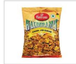
Chana Jor Garam