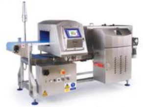
IQ4 Conveyorized Metal Detection System (Non Meat)