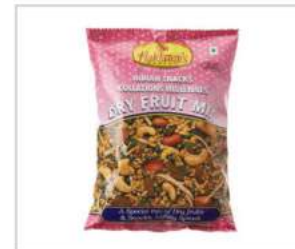
Dry Fruits Mix