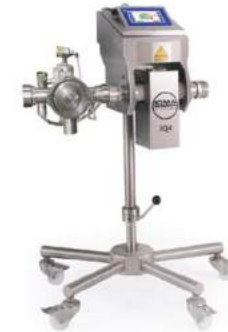
IQ4 Pipeline Metal Detection (Non Meat)