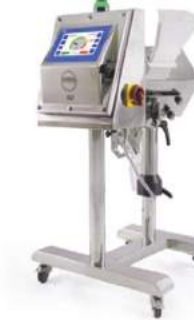
IQ4 LOCK-PH Metal Detection