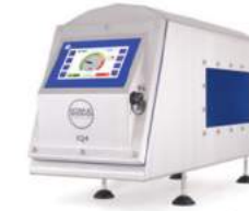
IQ4 Rectangular Search Head