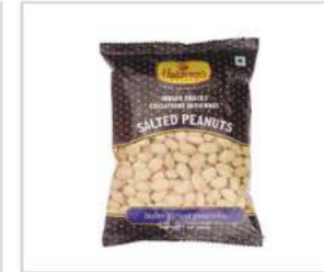
Peanuts. India's favorite chakhna