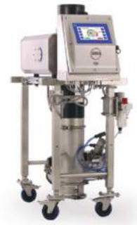
IQ4 Vertical Fall Metal Detection