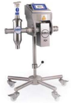
IQ4 Pipeline Metal Detection