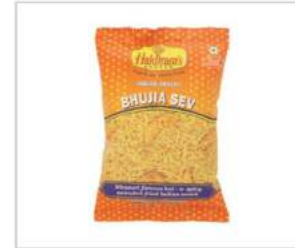
Bhujia. Haldiram's started by making Bhujia